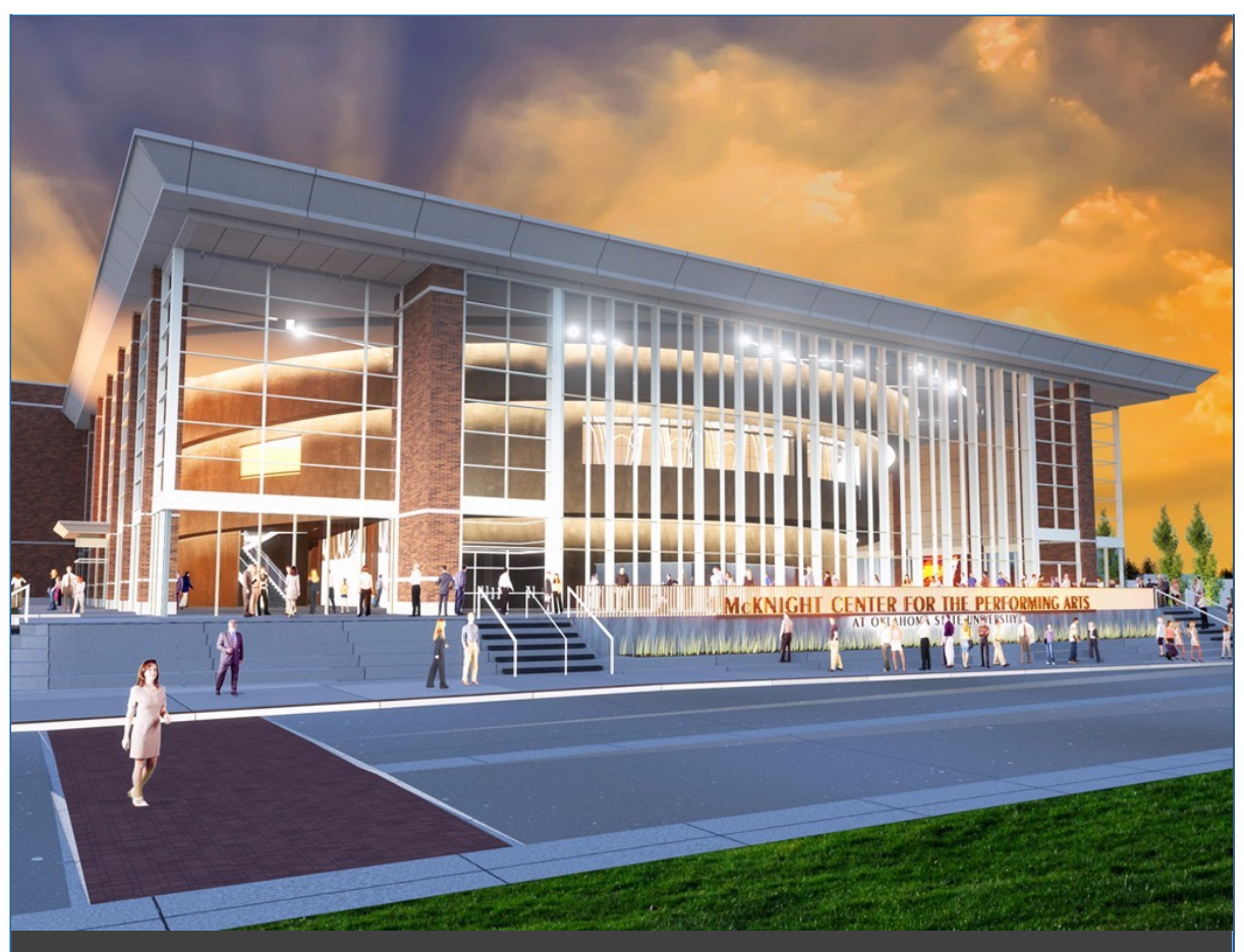
The McKnight Center for the Performing Arts at Oklahoma State University wil

international destinations. Quick check-in, free parking, short security line, 5-minutes from Oakcreek!