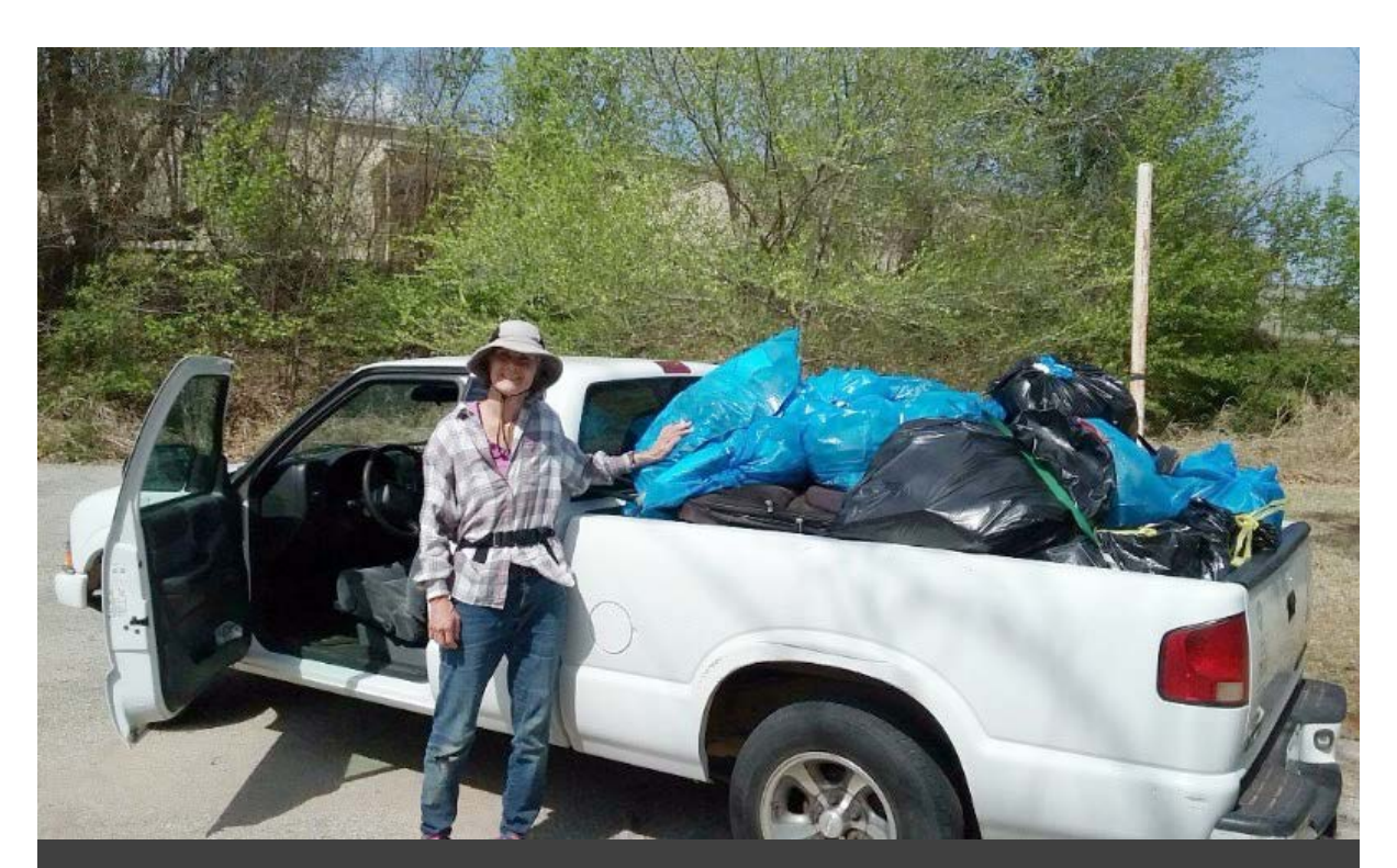
Trash Off Stillwater Day, March 2018

March 31, a team consisting of eight Oakcreek members and two neighbors from nearby hlCrescent Street, picked up trash along the part of the Kameoka Trail which parallels the back side of Oakcreek's property. Twenty- two bags of trash, a suitcase, 17 baseballs, a golf ball, and a bicycle seat were retrieved from the public path and the wooded areas near the path. The team came in second place. The winning team collected 25 bags of trash and a Christmas tree. In reality, all involved were winners as their efforts helped "clean up" Stillwater, Oklahoma. The section of the Kameoka Trail where the team picked up looks great! It makes walking there a pleasure.