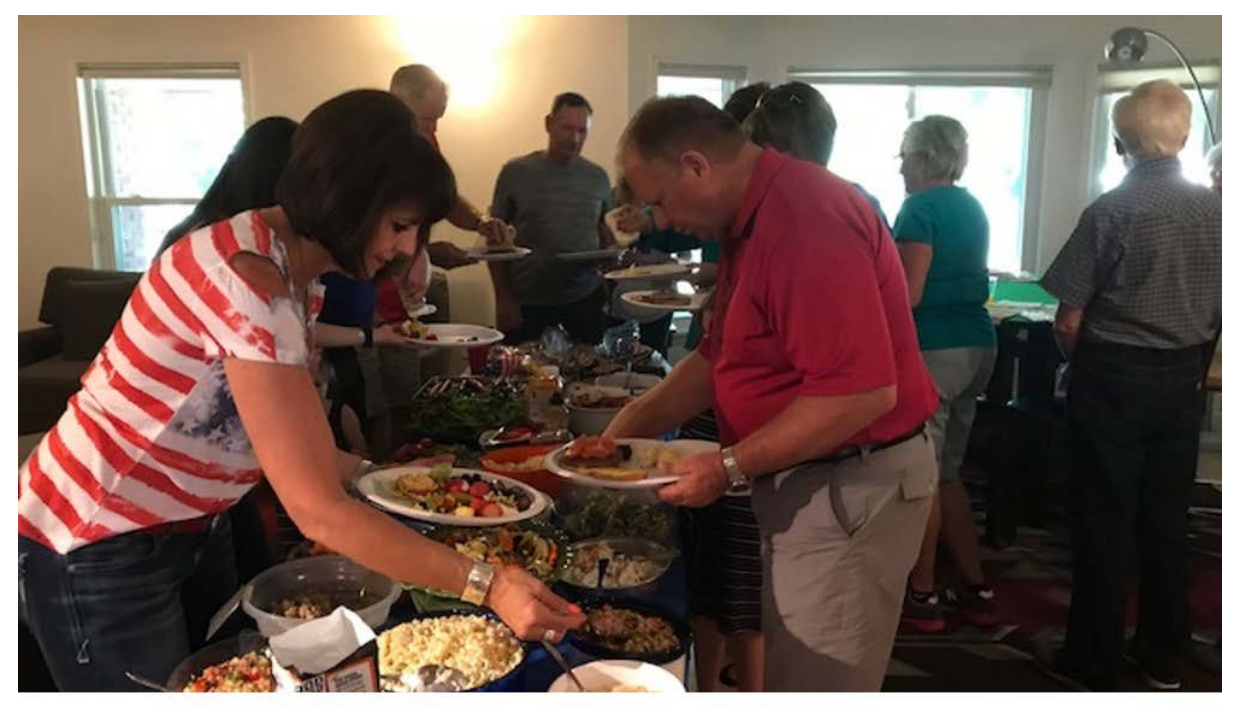
Individual selections are made

A variety of side dishes appear – along with a mini-keg of home brew.