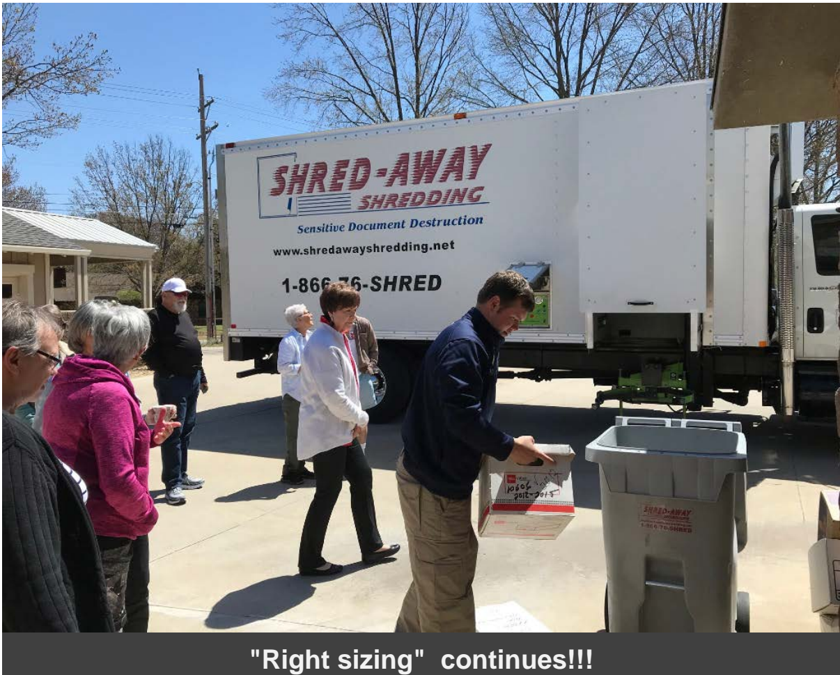
"Right sizing" continues!!! The pooled volume merits a site visit by the Shred-Away truck.

An 80th birthday calls for a labor-intensive checker-board cake to celebrate.