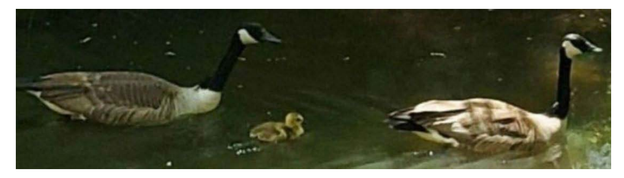
A diversity of residents at Oakcreek.

In the middle of a city, set out a few acres peppered with trees and plants. Add 24 houses and a little over 30 people. These neighbors become your friends who welcome you to dinner, work beside you, laugh with you, and are there for you in time of need. This place becomes home through the close relationships you build within a cohousing community.