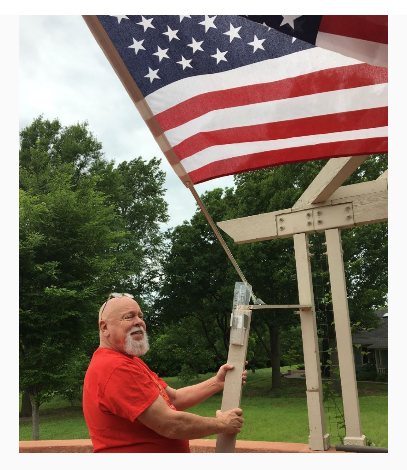
Memorial Day In Honor of our Veterans