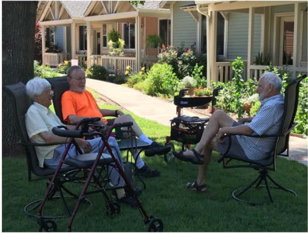
catch up with neighbors