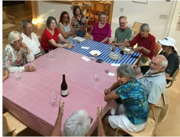
share a drink at Happy Hour