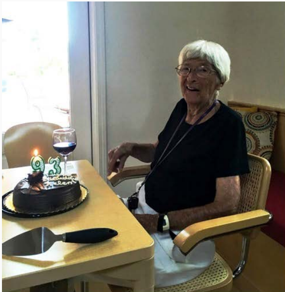
Celebrate a 93 rd Birthday or Sadly, watch the removal of a dying tree.