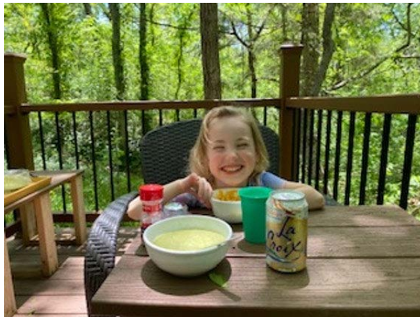
Visiting grandkids also get to help with chores.