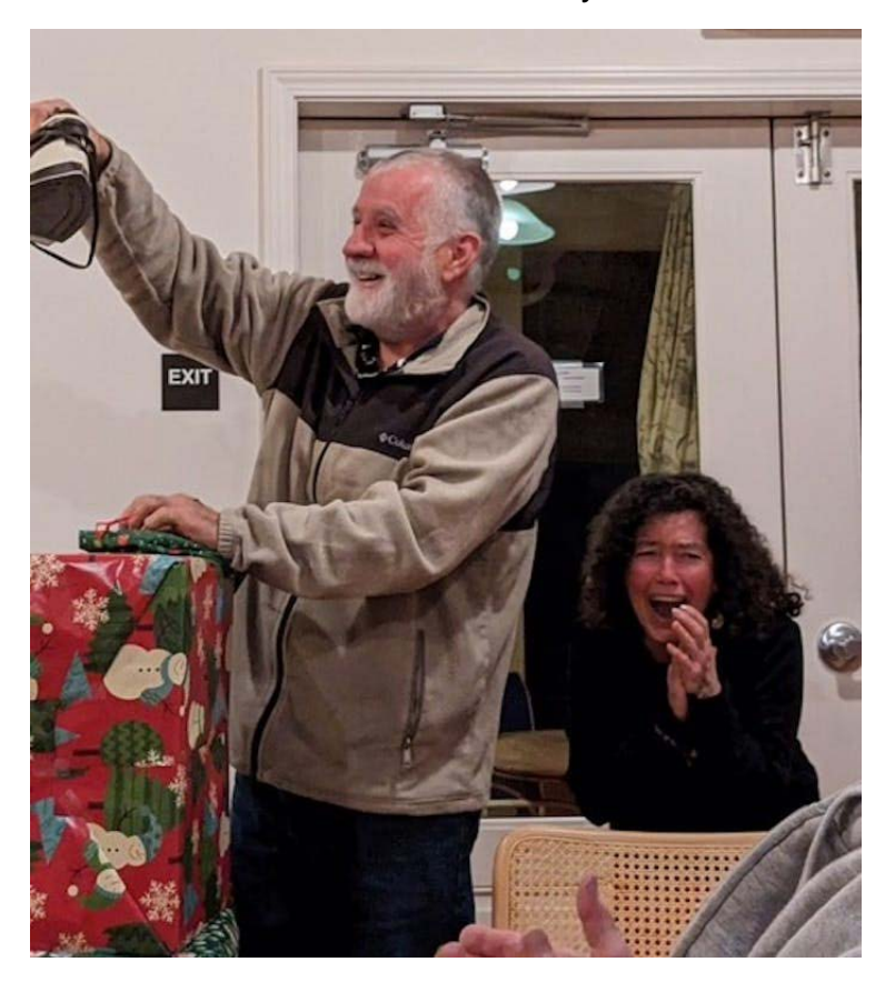
As always, the holidays