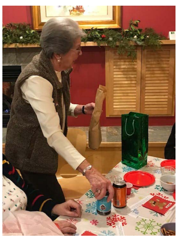
...no one stole the iron from Raoul. In fact, many asked, 'What's That???'