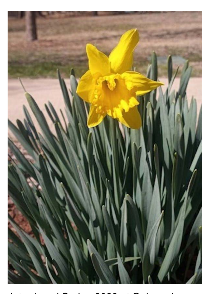
An outstanding show of daffodils has introduced Spring 2023 at Oakcreek Community.