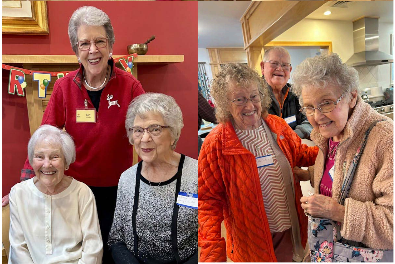
For Thanksgiving, Christmas, and New Year's Day,