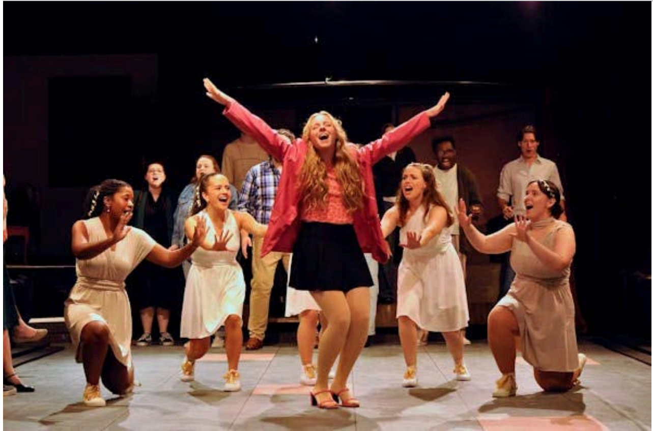
Legally Blond , 2025, Photo by Shannon DeYong