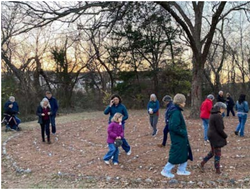
Enjoying a Winter Solstice walk with friends and neighbors at our Oakcreek labyrinth.