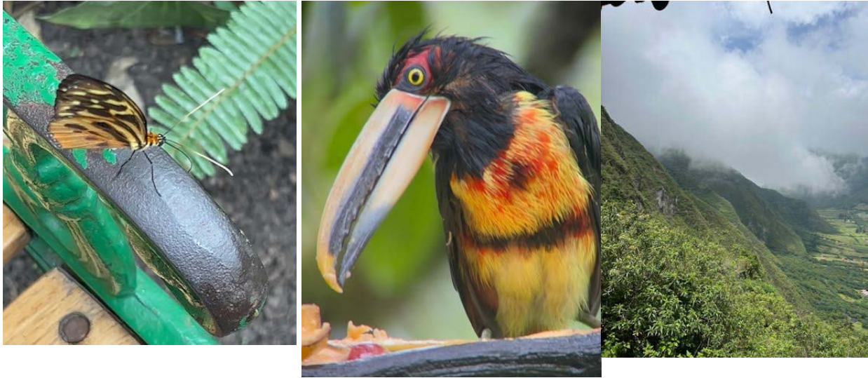
Butterfly Habitat, Birds, and Volcanoes. (So, SO many birds!)

Oklahoma is OK, but... Stillwater is Stellar!