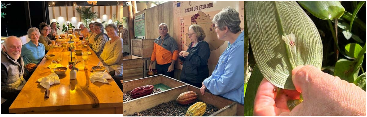
Resort meals, Coffee & Chocolate Tour, Orchids